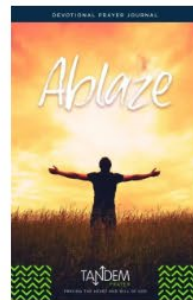
Ablaze Prayer Journal Free Download