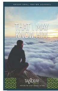
That I May Know Him Free Download