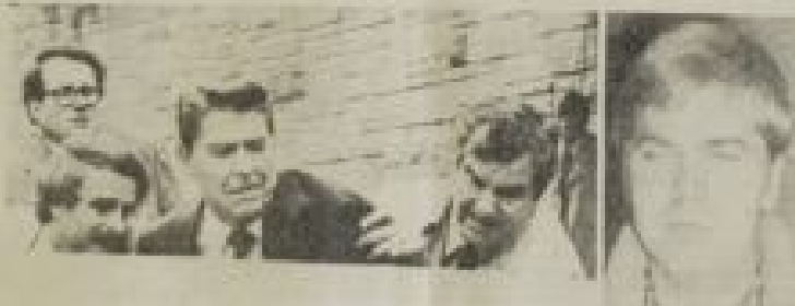
Secret Service agents escort President Reagan to the hospital after he was shot in the chest by a gunman in a Washington, D.C., hotel last night.

The president's condition is "excellent," according to doctors. He is expected to make a full recovery. The three other people who were shot are also expected to make a full recovery.