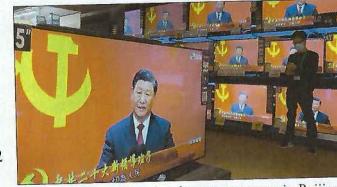
Xi's speech, as seen at a department store in Beijing