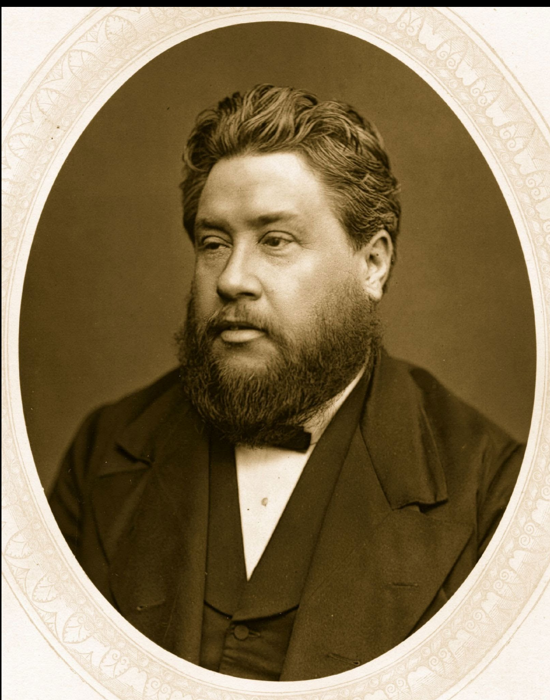
Charles Haddon Spurgeon 1834-1892 The “Prince of Preachers”