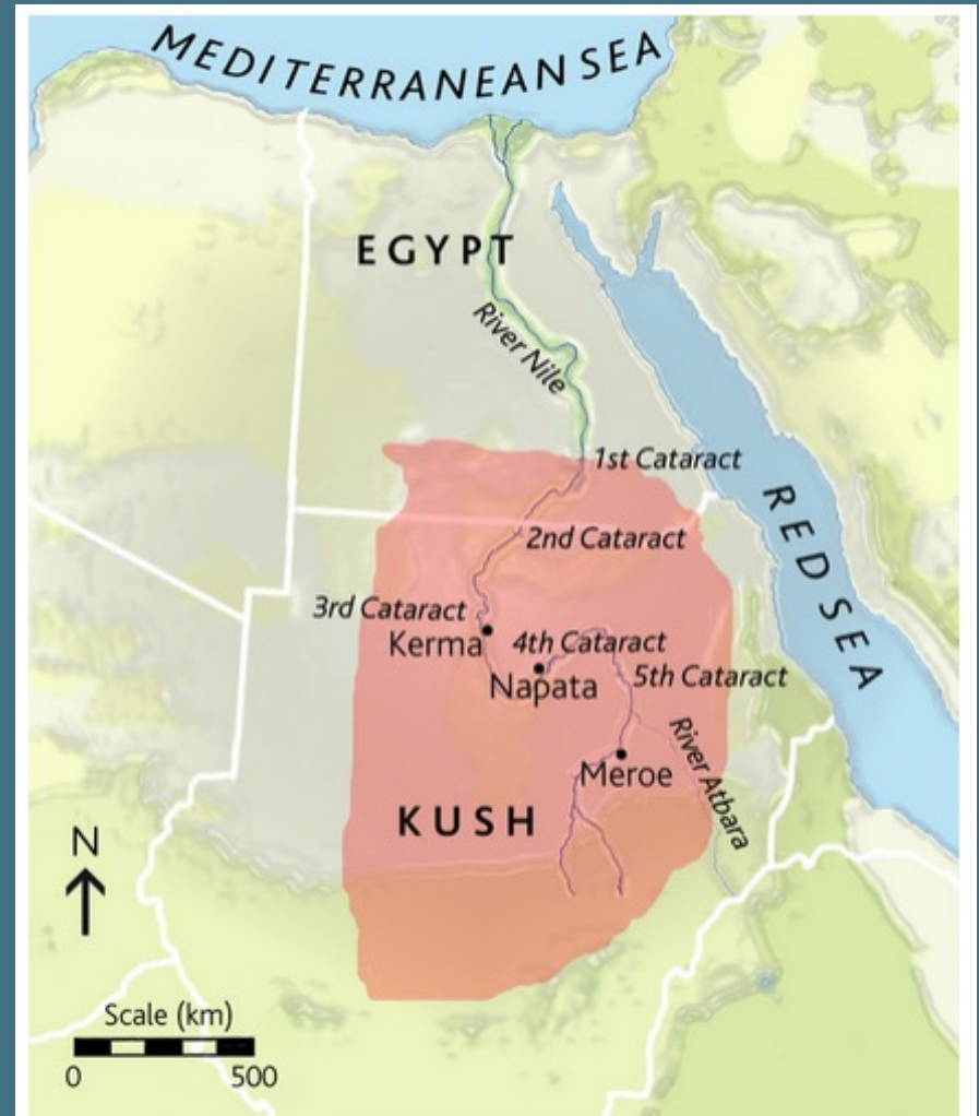
The ancient Kingdom of Kush covers much of modern-day Sudan.

27 And he rose and went. And there was an Ethiopian, a eunuch, a court official of Candace, queen of the Ethiopians, who was in charge of all her treasure. He had come to Jerusalem to worship