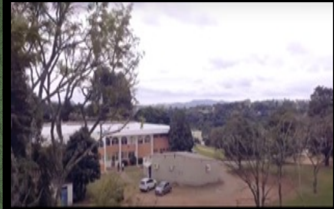
↑ First Youth Camp