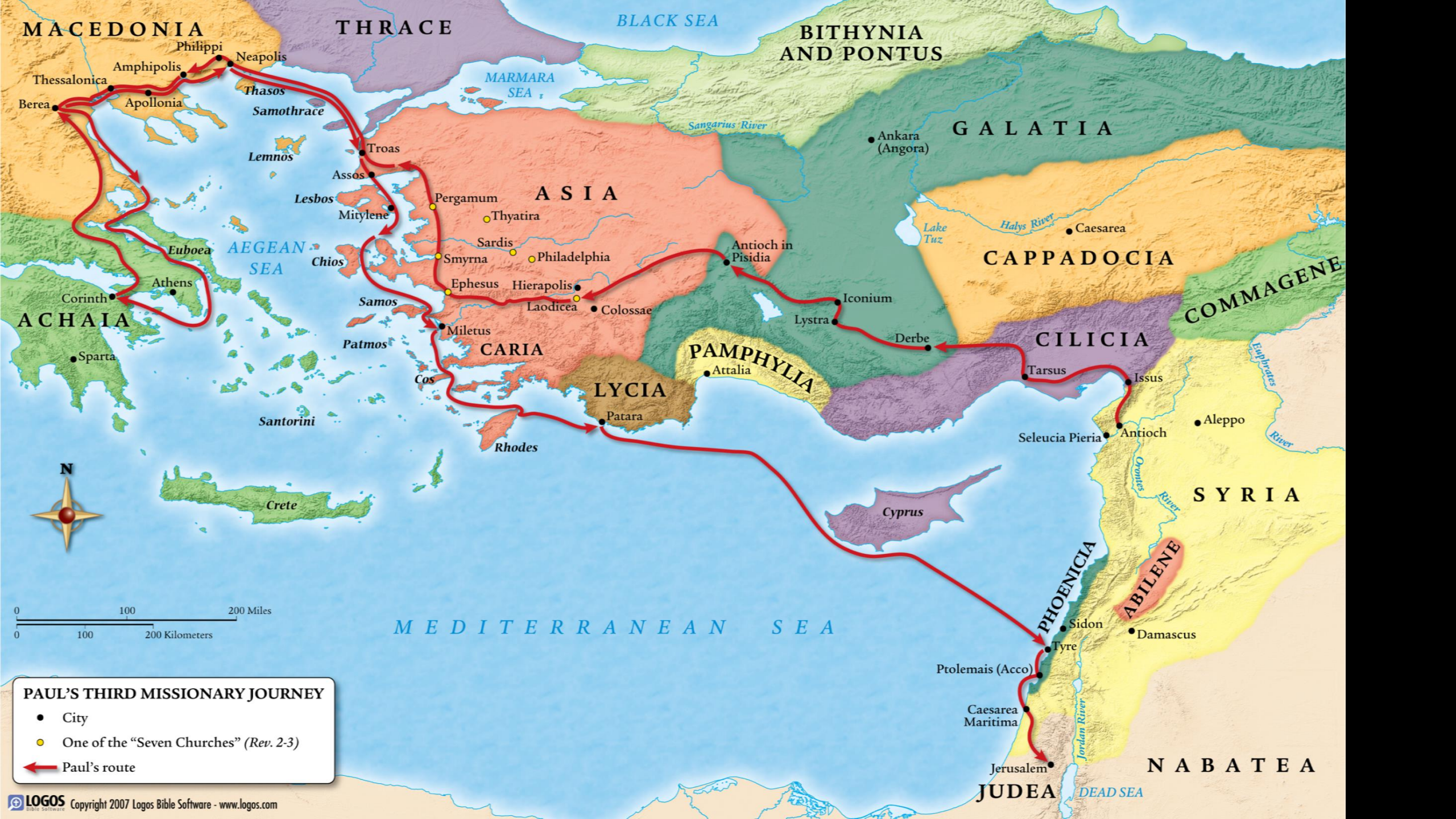
PAUL'S THIRD MISSIONARY JOURNEY • City • One of the "Seven Churches" (Rev. 2-3) ← Paul's route